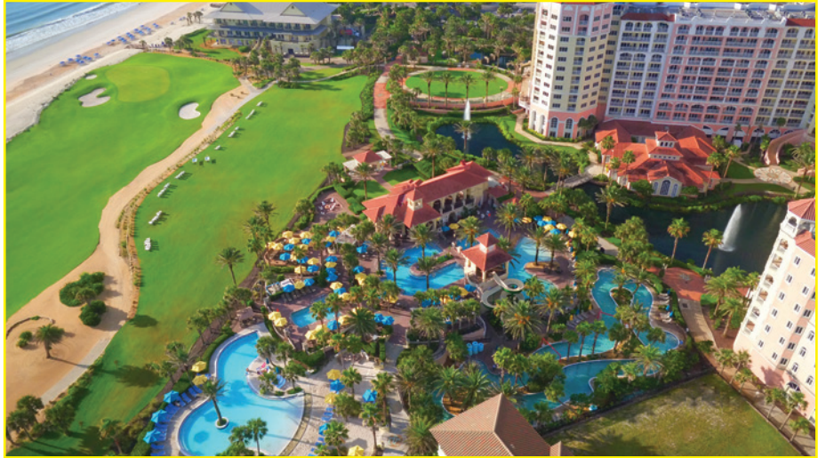
Hammock Beach Golf Resort & Spa • Palm Coast, Florida

R RE REG REGI REGIS REGIST REGISTE REGISTER REGISTER N REGISTER NO REGISTER NOW REGISTER NOW!